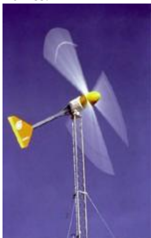
Bergey Wind Power

Small, lightweight turbines such as the one shown below are available to make electricity for single homes.