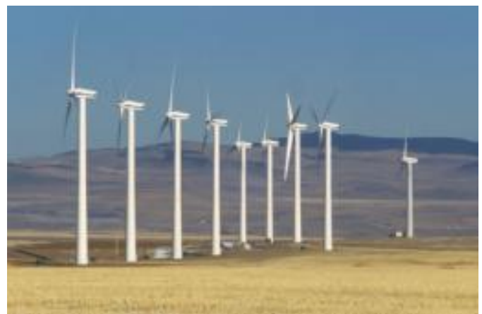
Vision Quest Windelectric Inc.

Electricity is now being generated on a commercial scale at large installations called “wind farms” in several places around the world. Wind farms consist of rows of towers, sometimes 90 metres high, equipped with giant wind turbines for producing electricity. In Canada, the first commercial wind farm was built in southern Alberta near the town of Cowley, in a region famous for its strong, steady winds. Commercial wind farms have also been established in Germany, Denmark, the United States, Spain and India. Denmark and Germany have pioneered the development of commercial wind power, one of their fastest-growing industries.