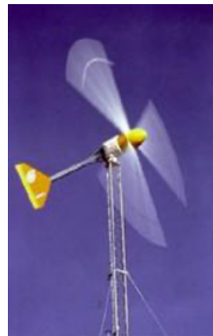
Bergy Wind Power.

Small, lightweight turbines such as the one shown to the right are available to make electricity for single homes.