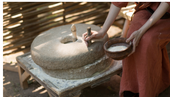
A millstone used to make flour.

Long before the invention of electricity, early wind turbines did very useful work. Windmills were used in many places in Europe over the last several centuries to turn heavy granite disks called millstones. The millstones were used to crush dry grains such as wheat, barley, and corn to make flour or meal.