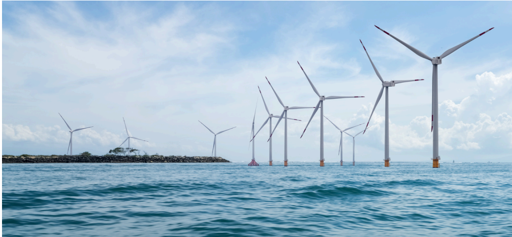
Example of a commercial wind farm on shallow waters.

Some companies are now installing wind farms in shallow waters near coastlines in small countries with little available land area. These “offshore wind farms” are a promising new source of electricity. Toronto Hydro is installing such a turbine offshore on Lake Ontario.