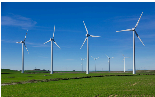
Example of a commercial wind farm on land.

Electricity is now being generated on a commercial scale at large installations called “wind farms” in several places around the world. Wind farms consist of rows of towers, sometimes 90 metres high, equipped with giant wind turbines for producing electricity. In Canada, the first commercial wind farm was built in southern Alberta near the town of Cowley, in a region famous for its strong, steady winds. Commercial wind farms have also been established in Germany, Denmark, the United States, Spain and India. Denmark and Germany have pioneered the development of commercial wind power, one of their fastest-growing industries.