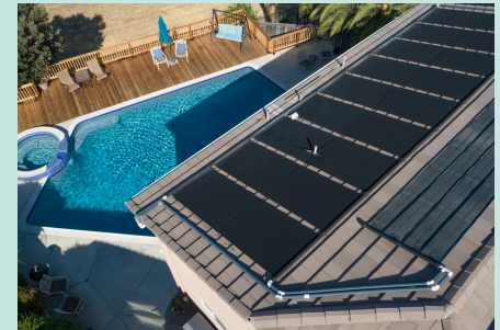
Solar home heating.