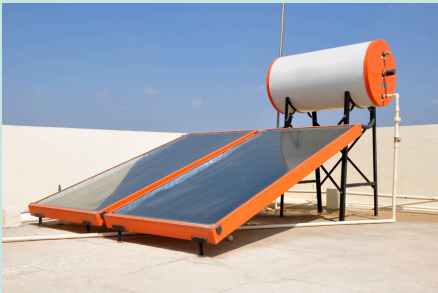
Solar water heaters.