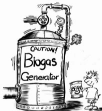
Two common sources of biogas. Dave Mussell

Most mammals, humans included, produce a flammable gas called “biogas” as they digest their food. Bacteria living in their digestive systems produce methane as they break down cellulose present in the food. Biogas is also produced in bogs and wet-lands where large amounts of rotting vegetation may accumulate. Biogas consists mostly of a gas called methane, which is the same as “natural gas”, commonly burned in our furnaces and barbecues. Biogas can be used instead of natural gas for heating and cooking.