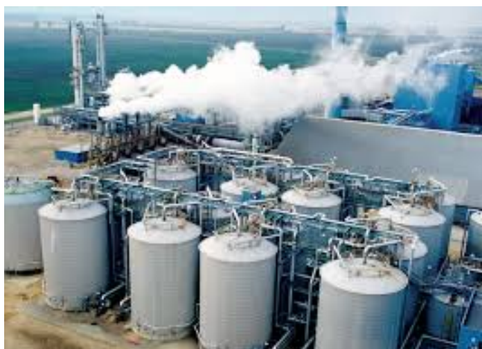
Ethanol and methanol can be made from plant materials such as corn, at refineries like this one.

Both ethanol and methanol make excellent fuels for cars and trucks. In fact, ethanol is used in the engines of Formula 1 racing cars. It burns very cleanly and delivers more power than gasoline. Many service stations now sell fuels that contain a blend of gasoline and an alcohol, usually ethanol.