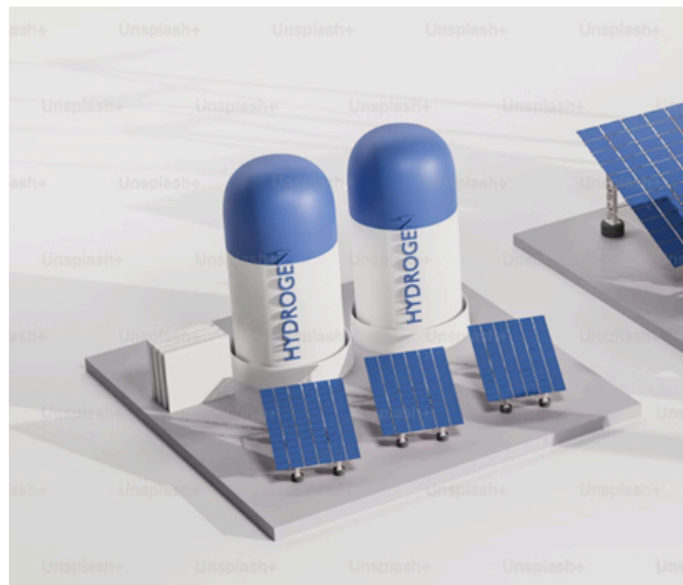
Hydrogen storage tank.

The biggest difficulty faced by engineers designing fuel cells is figuring out how to store and handle the hydrogen safely. Hydrogen is composed of extremely tiny molecules that can squeeze out of most materials normally used to contain gases. Hydrogen is highly explosive and flammable. For efficient storage, it must be compressed and cooled to minus 253°C to form a liquid. Liquid hydrogen must be stored in specialized containers and pumped through high-tech valves and tubes, all of which make hydrogen expensive and tricky to handle.