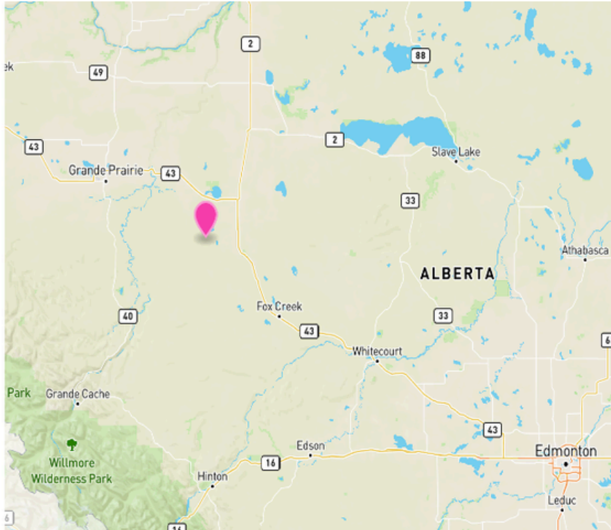
Figure 3. Purposed geothermal plant location (Government of Alberta, 2021).

The Greenview Geothermal Power Plant (Alberta No. 1) is a 10MW electricity power plant proposed to be completed by 2025 (Alberta No. 1, 2024). Once constructed, this power plant will be the first conventional geothermal energy facility in the province, offsetting over 97,000 tonnes of CO 2 emissions annually. (Government of Alberta, 2021)