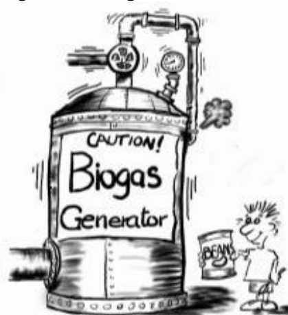
Two common sources of biogas. Dave Mussell

Most mammals, humans included, produce a flammable gas called “biogas” as they digest their food. Bacteria living in their digestive systems produce methane as they break down cellulose present in the food. Biogas is also produced in bogs and wet-lands where large amounts of rotting vegetation may accumulate. Biogas consists mostly of a gas called methane, which is the same as “natural gas”, commonly burned in our furnaces and barbecues. Biogas can be used instead of natural gas for heating and cooking.