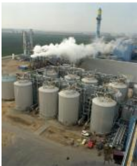
Ethanol and methanol can be made from plant materials such as corn, at refineries like this one.

Both ethanol and methanol make excellent fuels for cars and trucks. In fact, ethanol is used in the engines of Formula 1 racing cars. It burns very cleanly, and delivers more power than gasoline. Many service stations now sell fuels that contain a blend of gasoline and an alcohol, usually ethanol.