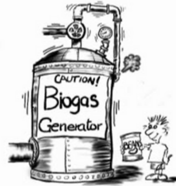
Two common sources of biogas.

Most mammals, humans included, produce a flammable gas called “biogas” as they digest their food. Bacteria living in their digestive systems produce methane as they break down cellulose present in the food. Biogas is also produced in bogs and wet-lands where large amounts of rotting vegetation may accumulate. Biogas consists mostly of a gas called methane, which is the same as “natural gas”, commonly burned in our furnaces and barbecues. Biogas can be used instead of natural gas for heating and cooking.