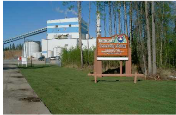
This generating station in Canada burns biomass fuel from nearby sawmills to produce energy.

Most green plants have large amounts of a stiff material called cellulose. Cellulose is one of the main ingredients in wood and is extracted for use in paper making. Green plants manufacture cellulose from sugars, which they make during photosynthesis. Because cellulose is made from sugar, it contains a lot of stored chemical energy, energy that originally came from the sun. This chemical energy can be released as heat when wood is burned.