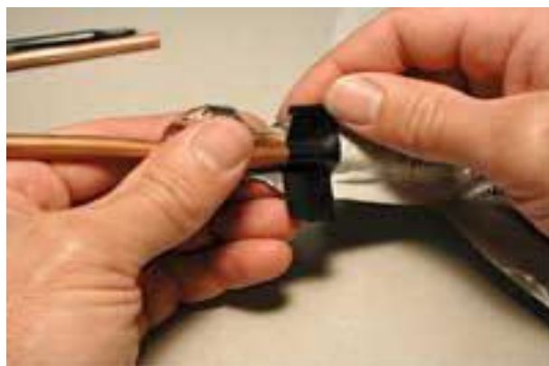
Taping the neck

Step 4: Securely tape the neck of the balloon to the tube.