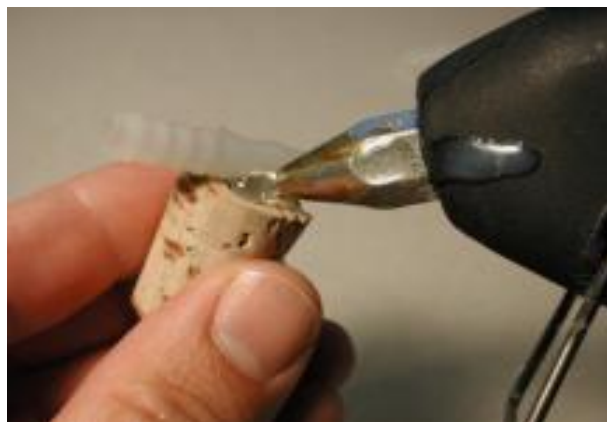
Gluing the cork

Step 5: Using a drill or cork borer, make a small (4mm) hole in the center of the stopper. Add a few drops of hot glue around and inside the hole and insert the stem of the ¼-inch T-adapter into the cork.