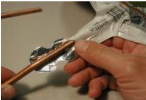
Inserting copper tubing

Step 2: The Mylar balloon has a sleeve-like valve that prevents helium from escaping once it is filled. This sleeve will help form a leak-proof seal around the rigid tubing. Push the tubing into the neck of the balloon, past the end of the sleeve, leaving about 2cm protruding from the neck of the balloon, as shown below.