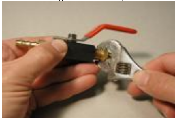
Installing the barb fittings on the ball valve

Step 6: Screw the two barb fittings into the body of the ball valve. Tighten with the adjustable wrench.