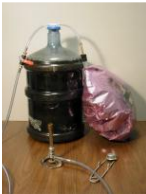
Completed biogas generator

Step 3: Set the biogas generator in a warm location, such as over a heat register or radiator or in a sunlit window. If the biogas generator is placed in a window, be sure to wrap the outside of the container in black plastic or construction paper, to discourage algae from growing inside the bottle.