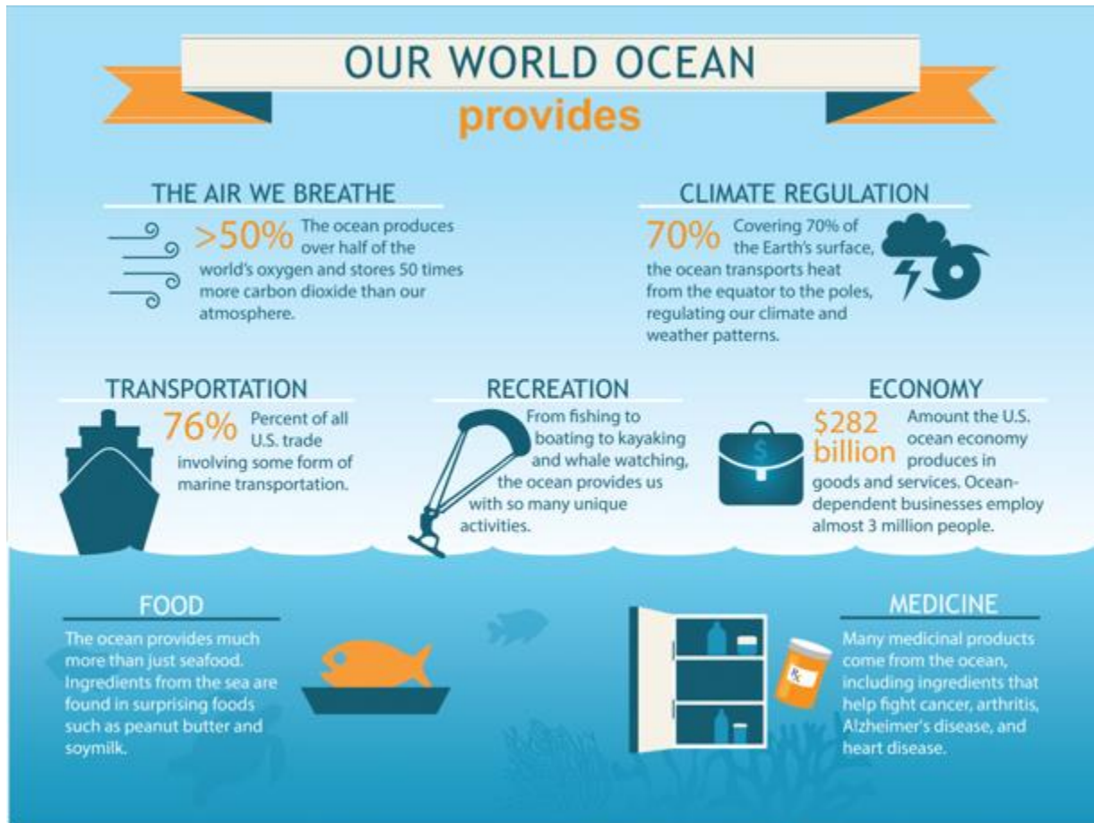
Figure 1: Our World Ocean