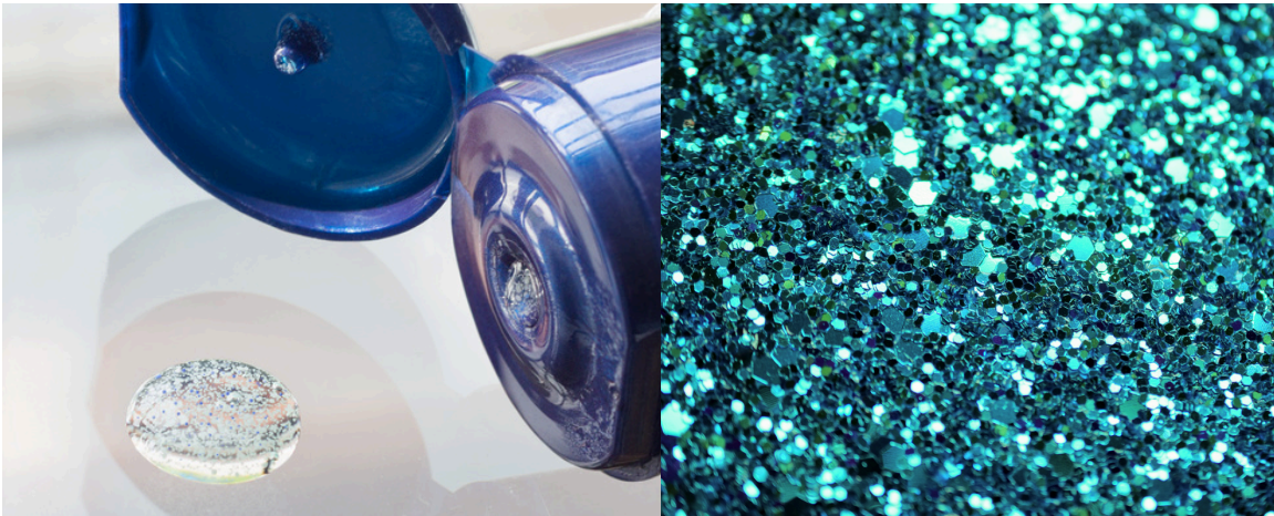
Example of microbeads found in exfoliating soap and glitter.